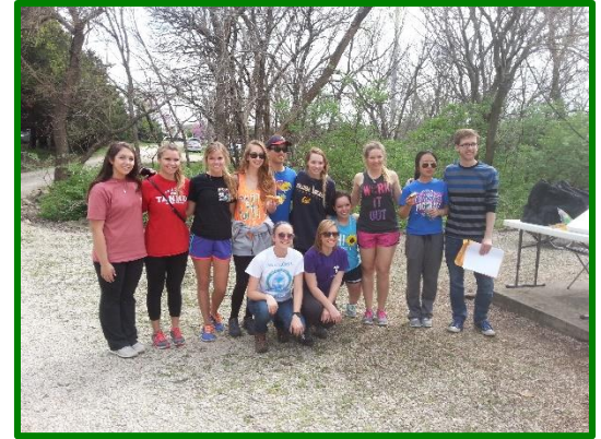
KU Alternative Break students added lots of muscle to the April Workday!

We want to thank everybody who came out to spend some time cleaning up our camp and making it beautiful after the winter. We couldn't do it without our volunteers!