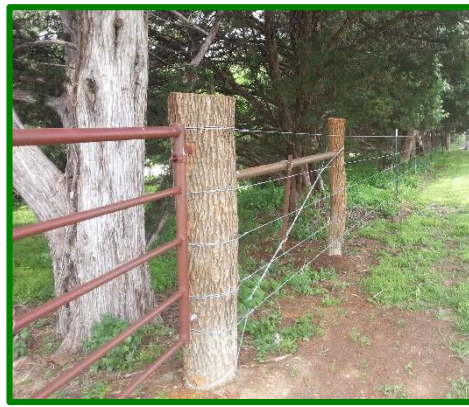
Friends donations helped fund a new people gate and fencing on two sides of the property. Hedge posts were harvested from the camp.