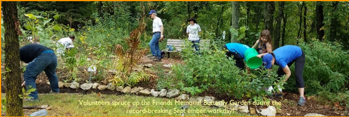
Volunteers spruce up the Friends Memorial Butterfly Garden during the record-breaking September workday!