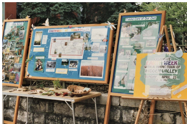
Twenty-two years ago the newly formed Friends "committee" of the Lawrence Hidden Valley board, announced themselves to the public with their first display at the 1995 Lawrence Earth Day event, followed by an Open House at the camp.