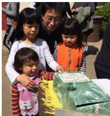
Brave, young participants explored the "mystery boxes" (above) and discovered the diversity of natural wonders found at Hidden Valley.